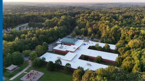
Roof Replacement Progress